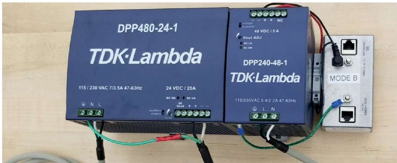
Fig. 3 Hawkeye Equipment Panel for Single-sensor Deployments

The equipment panel is the power and communications hub of the Hawkeye system. It is equipped with two environmentally hardened DC power supplies and a single 48 VDC passive PoE injector to support the Hawkeye sensor and adjacent components.