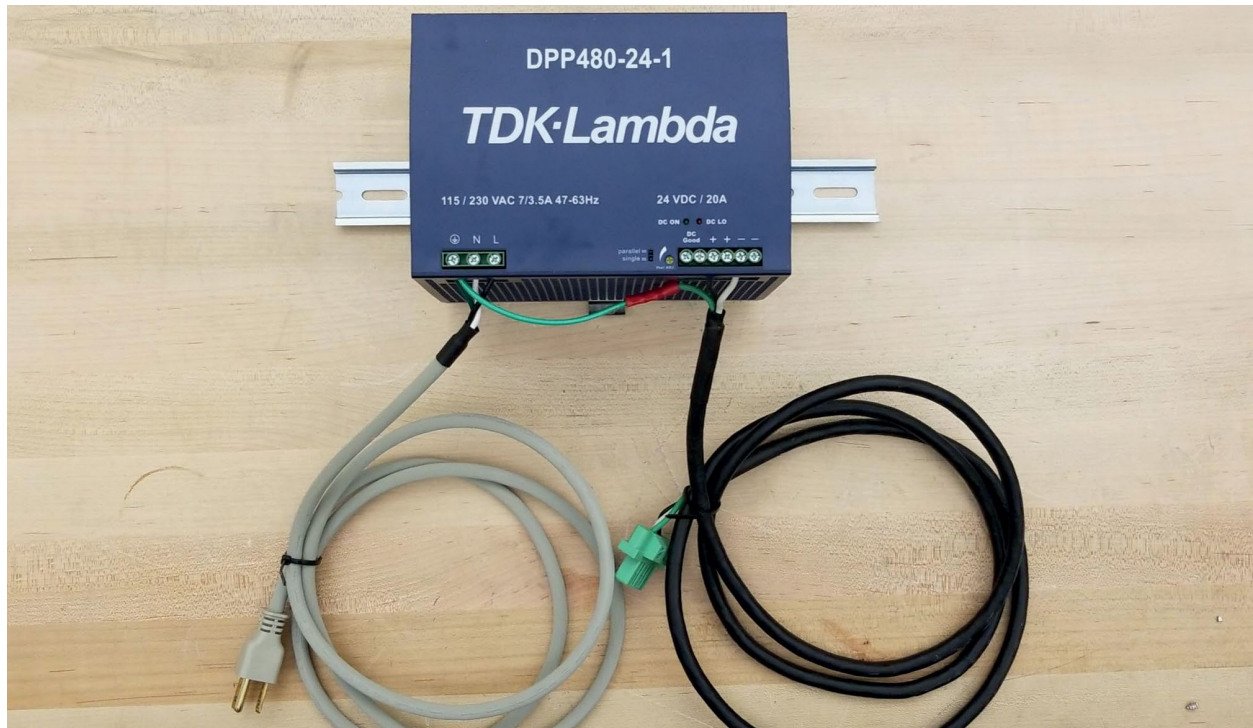
Fig. 2 Hawkeye Processing Unit Power Supply with Power Cables